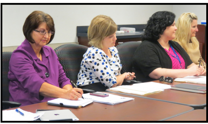
TGL Council Meeting

Leadership isn't about you, it's about the people you lead Sovernor Bill Haslam