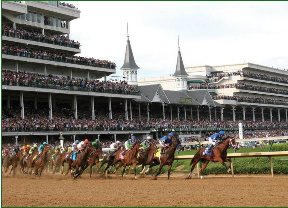
Churchill Downs – Home of the Kentucky Derby, the fastest two minutes in sports.