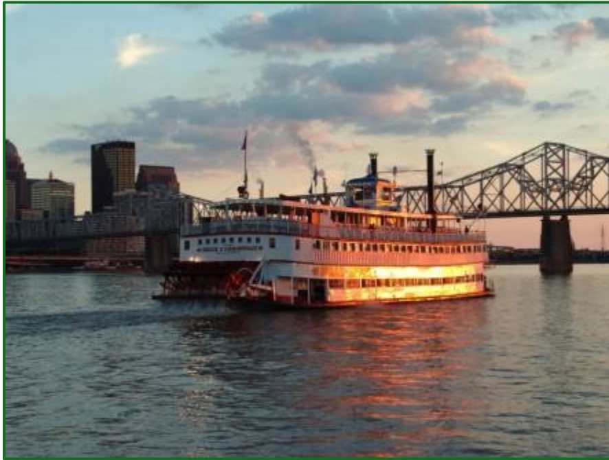
Belle of Louisville – The last remaining authentic Mississippi River-style steamboat