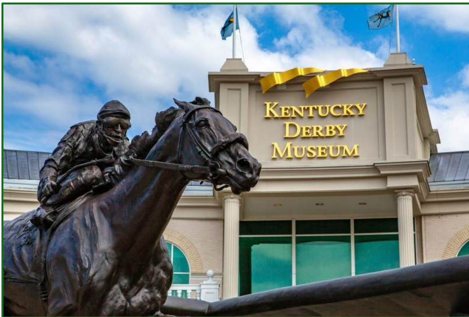
Kentucky Derby Museum – Experience Derby Day, Every Day!