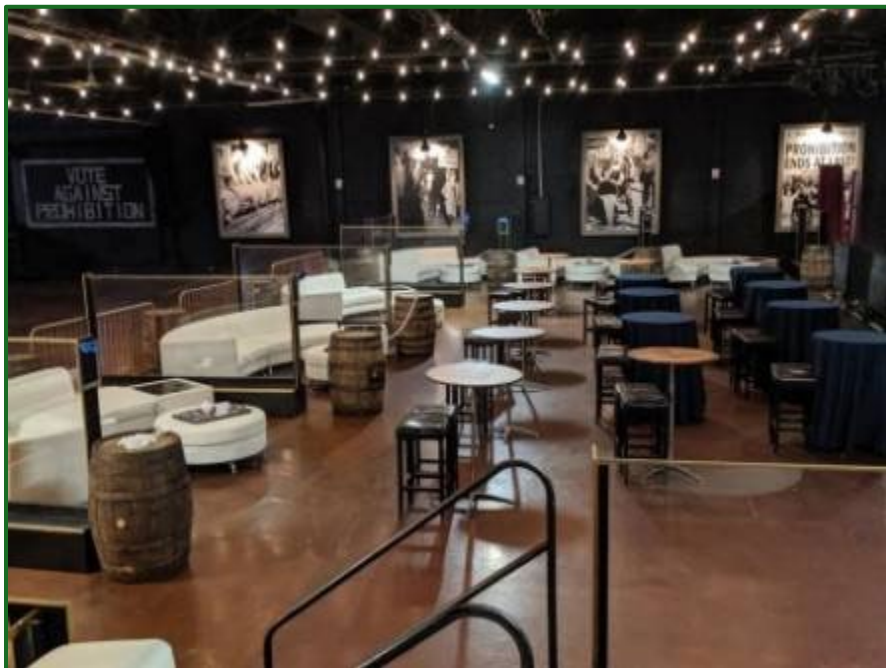
Bourbon Hall - Sitting adjacent to the Omni Hotel and Downtown Marriott is Louisville, KY's premier medium concert venue.